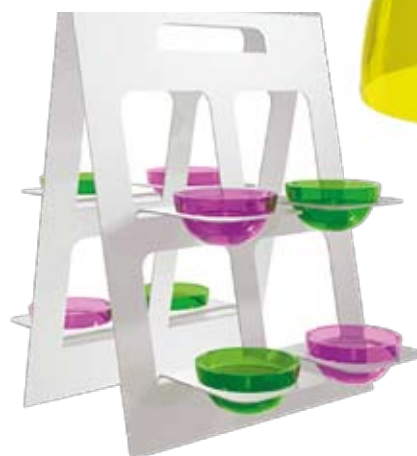
Fruittiera fruit stand in stainless steel